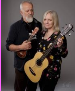
The Hedge Inspectors

Don't forget to book for October The 10th Bracklesham Bay Ukulele Weekend Queens Hotel, Eastbourne 30th Oct - 2nd Nov 2020